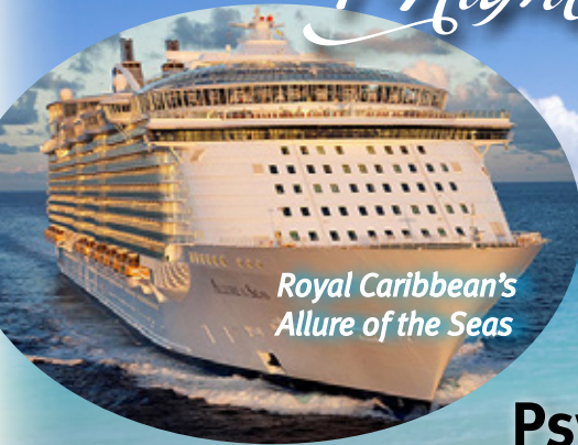
Royal Caribbean's Allure of the Seas

from Fort Lauderdale round trip to Nassau, St. Thomas, and St. Maarten